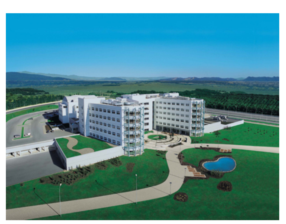
Anadolu Medical Center, Istanbul