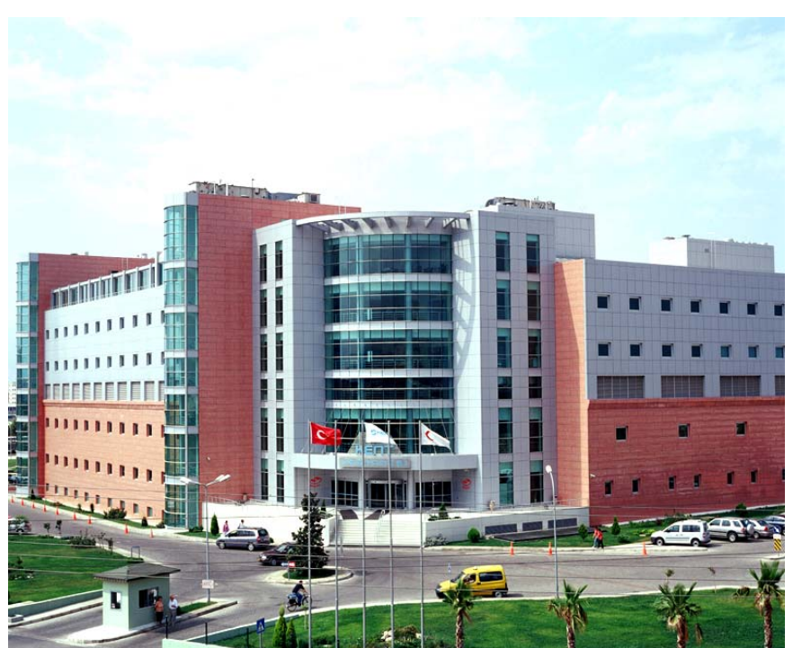
Kent Hospital, Izmir